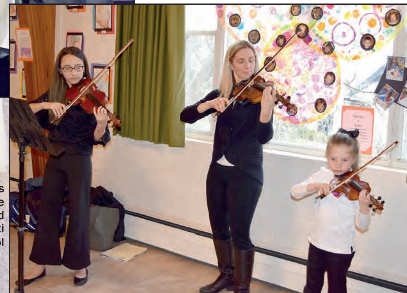
Performers from the Ridgefield Suzuki School