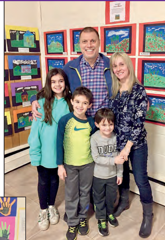
The Moreo family