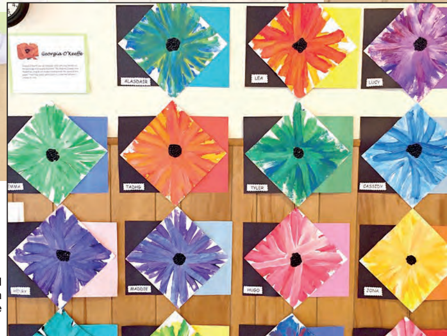
Works inspired by Georgia O'Keefe

The polka dot photos were done in the style of Yayoi Kusama, and the teachers allowed the children to do their own dots however they wanted.