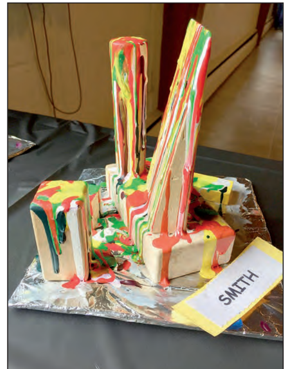
A block and crayon sculpture